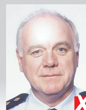
flash reflection on skin