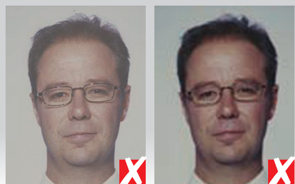
washed out colour