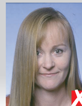
hair across eyes